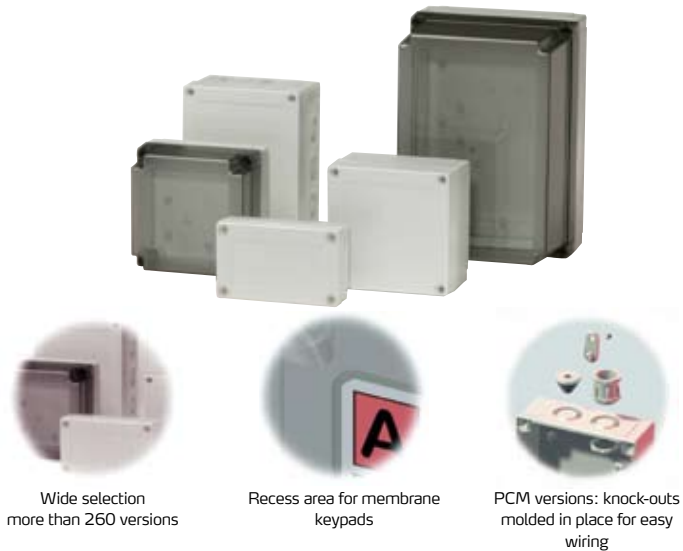
Wide selection more than 260 versions

MNX polycarbonate and ABS enclosures use world-class, 2-component injection moulding technology. They are designed to house and protect all types of electronic components in the most demanding applications. There are more than 260 standard versions in the MNX-range, including PCM-models with metric knock-out versions. Size range: 100 x 100 x 35 - 360 x 255 x 152 mm.