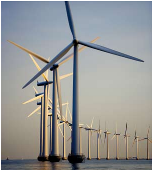
FIBOX CAB™ - For control panel housing:

New CAB PX and CAB P enclosures are specifically developed to meet the chemical, thermal and mechanical challenges in the harsh and demanding conditions of offshore environments.