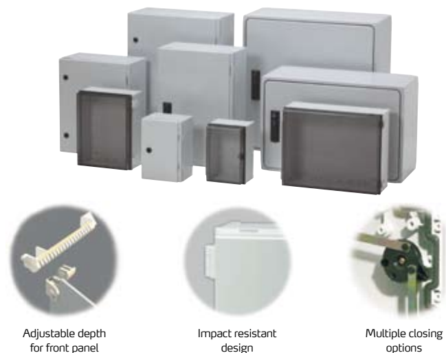
Adjustable depth for front panel

New CAB PX and CAB P enclosures are specifically developed to meet the chemical, thermal and mechanical challenges in the harsh and demanding conditions of offshore environments.